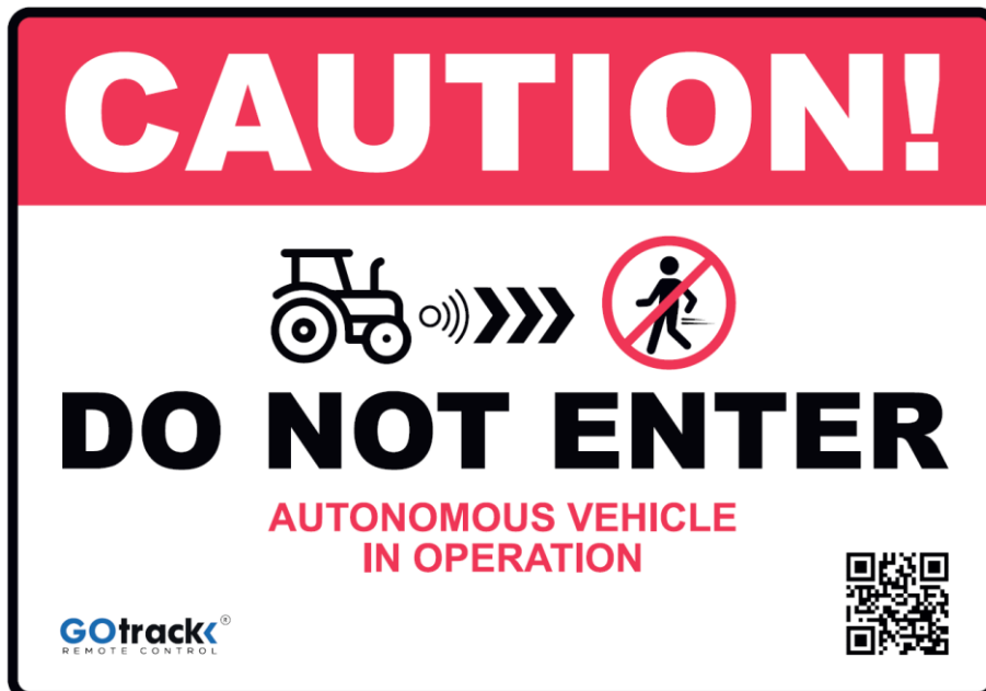
Diagram 4. Warning sign pattern, A3 format