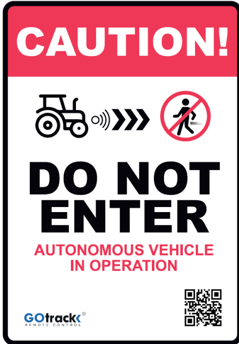
Diagram 3. Warning sign pattern, A4 format

In order to ensure safety, the area where the AD tractor moves should be properly marked. The markings should be visible from a distance to outsiders and placed with a frequency of not less than 1 sign per 100m and at every entrance to the area. The marking should be consistent with the graphic below: